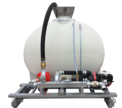
Sizes to suit Tipper or Tray Trucks